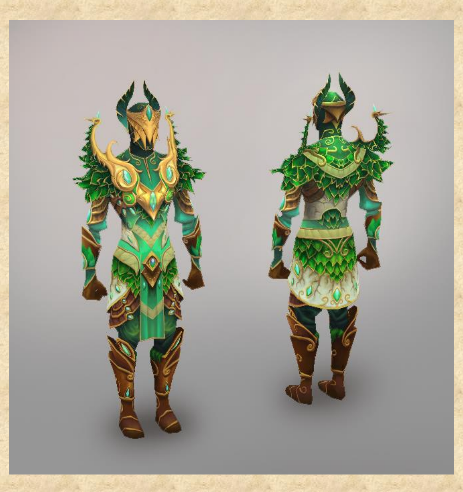
The melee (above), magic (below) and ranged (bottom) elves, as modelled and ready for launch in the Elf City!