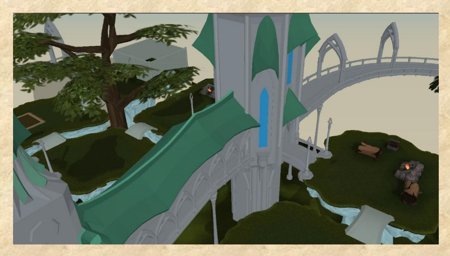
The Meilyr section, as it has been prototyped in our engine. This area will share similarities to Japanese gardens.