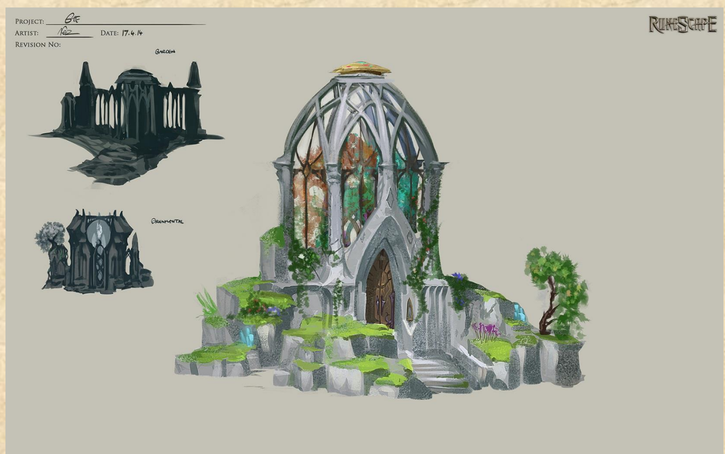
The Meilyr greenhouse, where players can buy recipes for their combination potions.

A player will be able to visit the Meilyr herblore shop to purchase recipes for the combination potions. These recipes will unlock the ability to combine the effects of different potions and create a new combination potion within a crystal flask (made in the Ithell area). There will be 20 different recipes in total for the player to buy, and 7 of these potion recipes must be found when Dungeoneering, in a similar manner to sagas. The player travels to the shop to 'unlock' the recipes once they have found them by paying an amount of gp. Once unlocked, the player permanently gains the ability to make the potion.