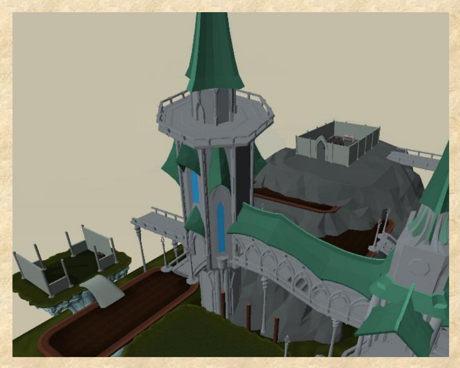
The Hefin section, as it has been prototyped in our engine. The temple at the back of the image houses the Seren Stones, and will be on a much larger mountain than is shown here.