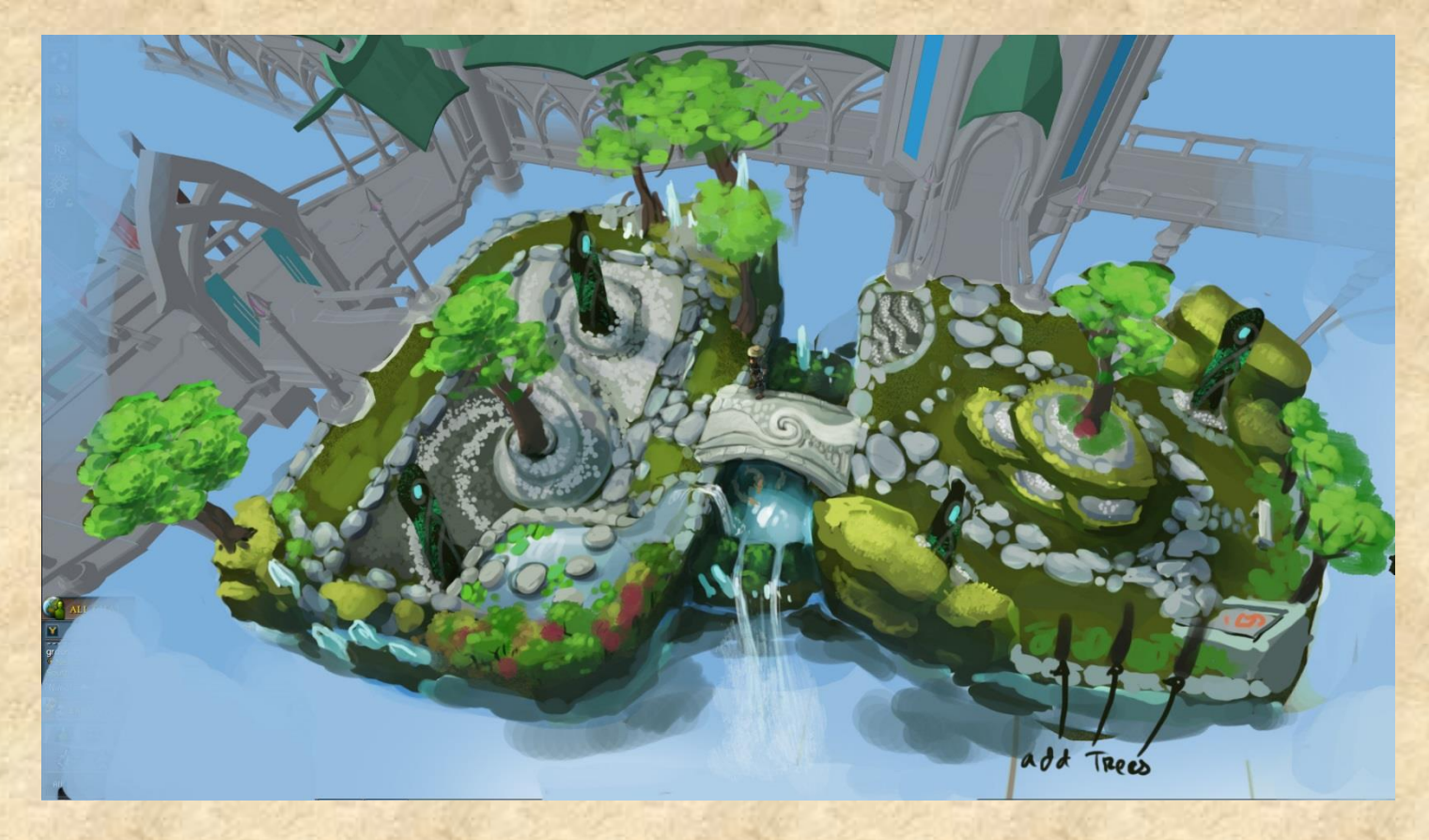
A paintover of the Meilyr 'harmony monoliths' section. Originally, the design stated that the monoliths would be logs, but this did not fit the Japanese water-garden feel.

Depending on time, the harmony monoliths and skilling potions may be <u>postponed</u> from Elf City Batch 2. They may instead be added to the Elf Spells and Prayers project. This reduction in an update's scope is common when developing game content. Regardless, your feedback on this update would be welcome.